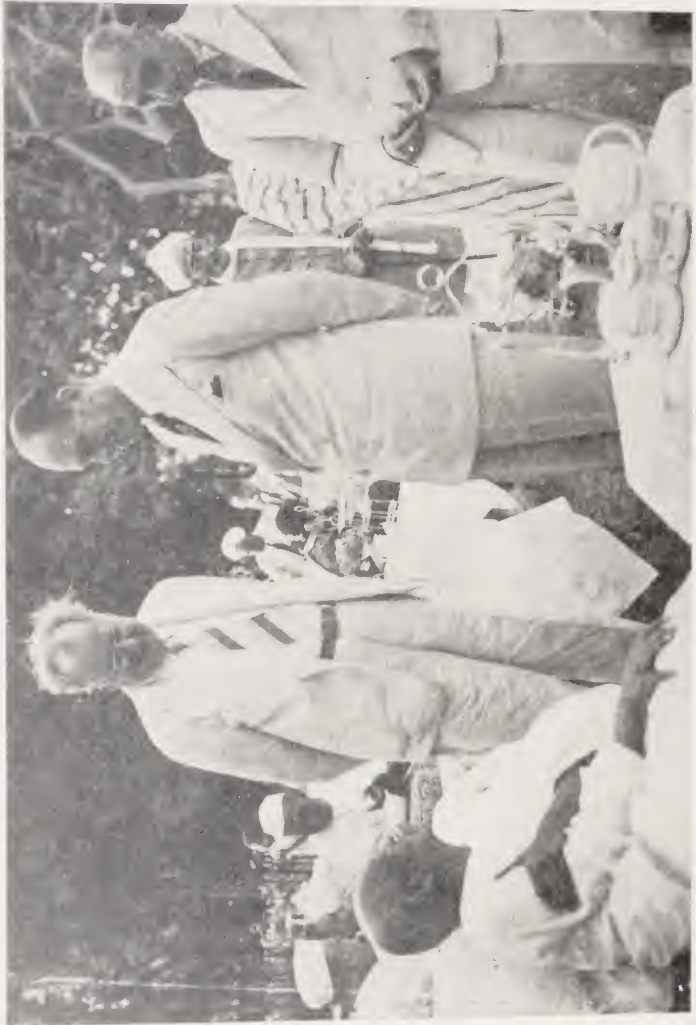
THE SARDAR HOSTING A RECEPTION TO CENTRAL INDIA PRINCES ON 20 APRIL 1948, IS SEEN TALKING TO HIS AMBASSADOR HENRY GRADY WHILE NETHERLANDS AMBASSADOR