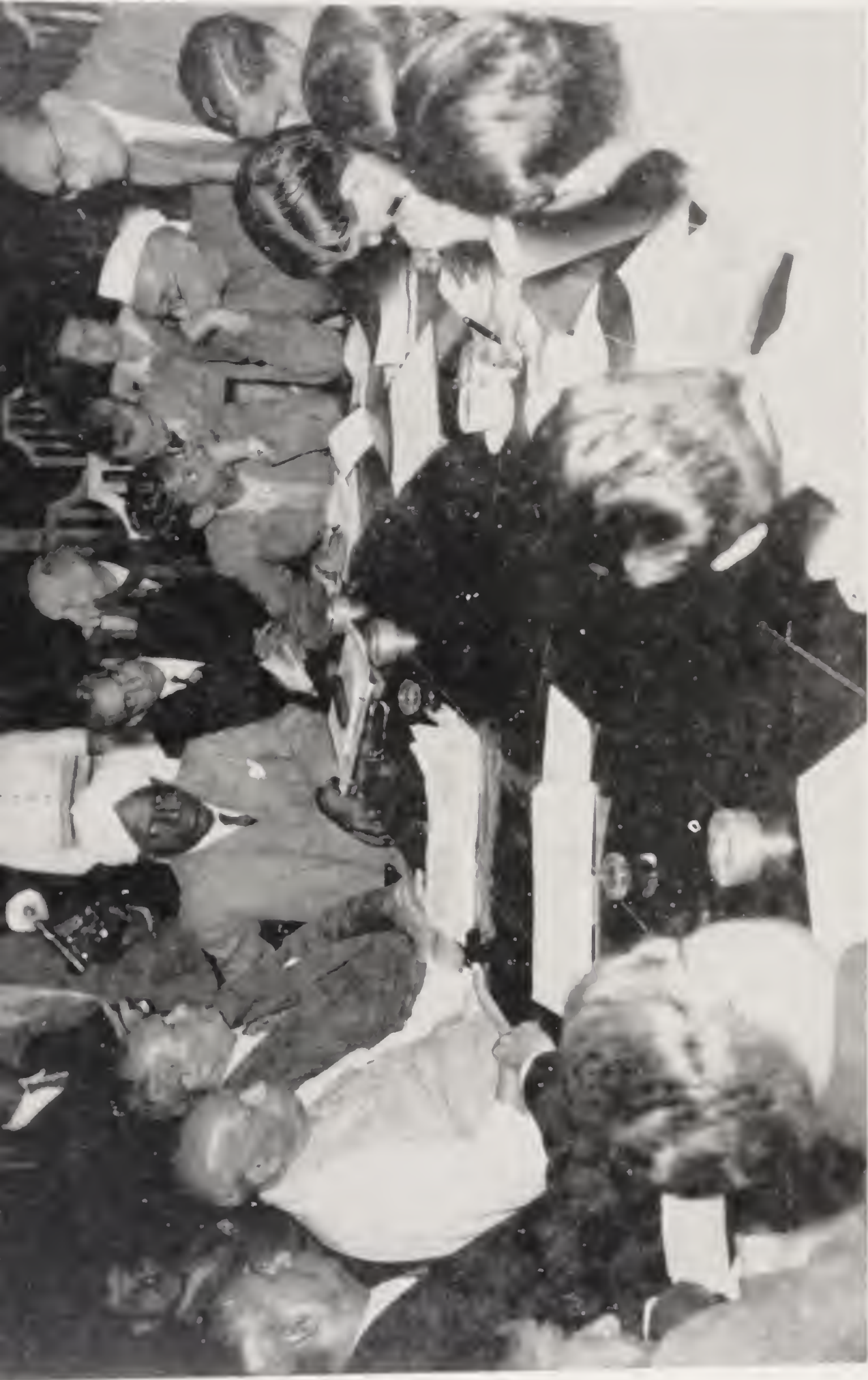
PRESS CONFERENCE BY SARDAR PATEL ON 12 JANUARY 1948 ON THE FINANCIAL SETTLEMENT WITH PAKISTAN.