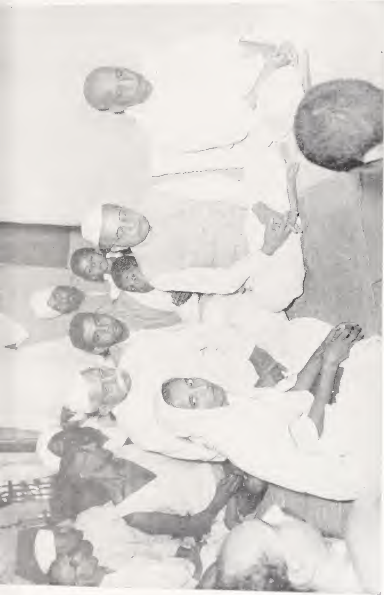
PATEL WITH MANGALDAS PAKVASA, GOVERNOR OF CENTRAL PROVINCES, RAVISHANKAR SHUKLA, PREMIER, AND MANIBEN PATEL SEATED ON HIS RIGHT AT MAHATMA GANDHI'S ASIIRAM