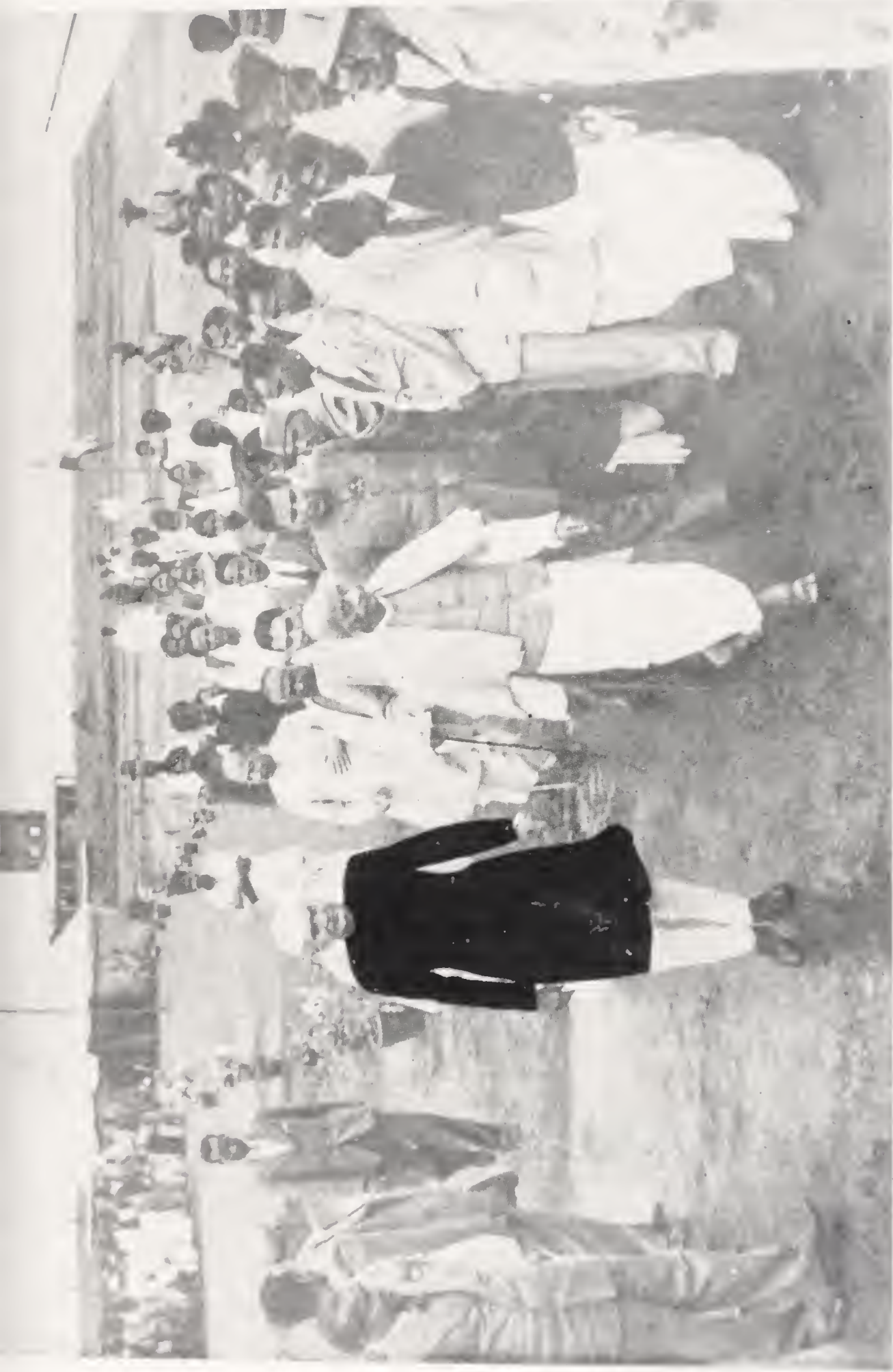
PATEL BEING RECEIVED AT CUTTACK AIRPORT. ON HIS RIGHT IS K. N. KATJU, GOVERNOR OF ORISSA, AND ON HIS LEFT HAREKRUSINA MAHTAB, PREMIER