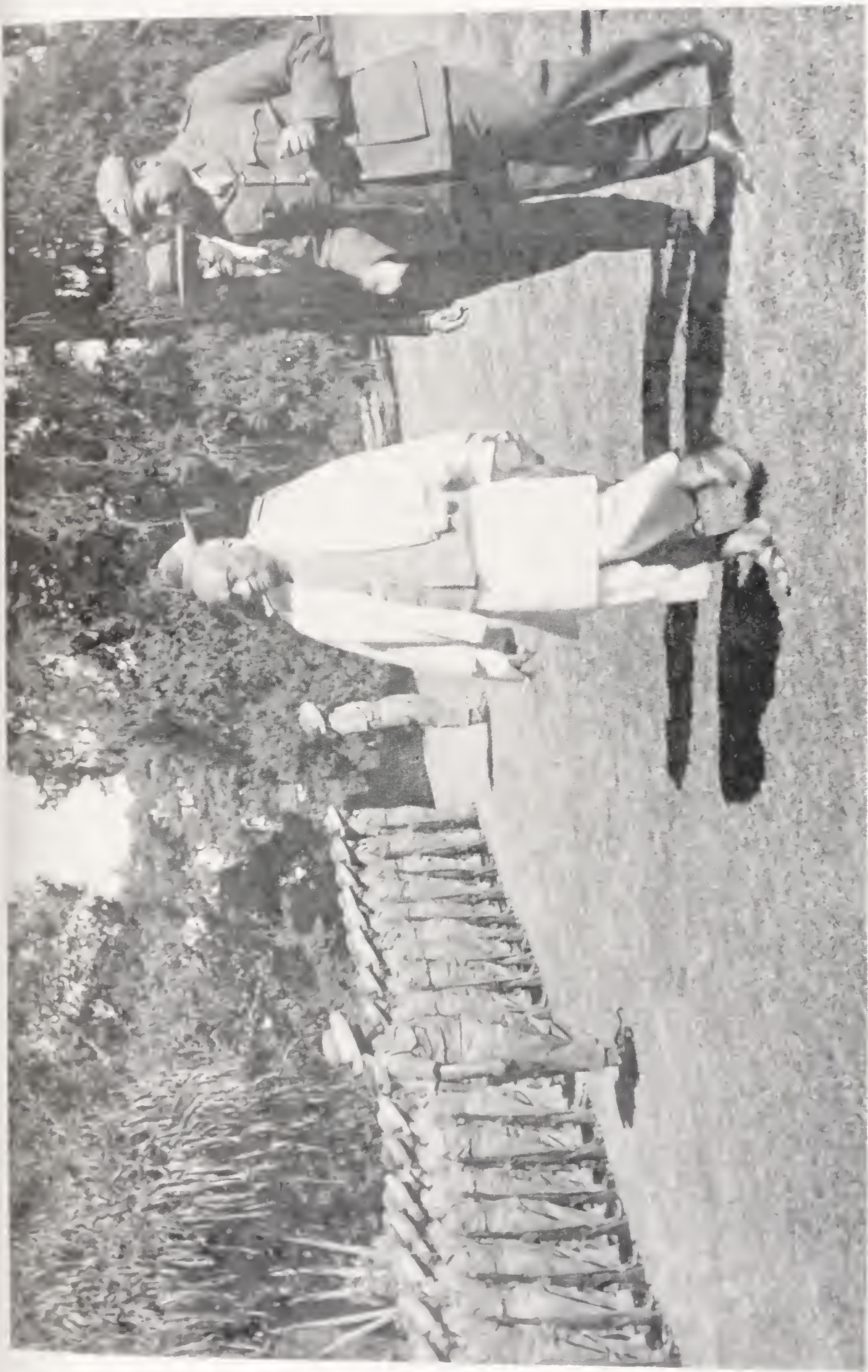
SARDAR PATEL INSPECTS A GUARD OF HONOUR DURING HIS VISIT TO ASSAM. GOVERNOR AKBAR HYDARI IS WALKING JUST BEHIND HIM