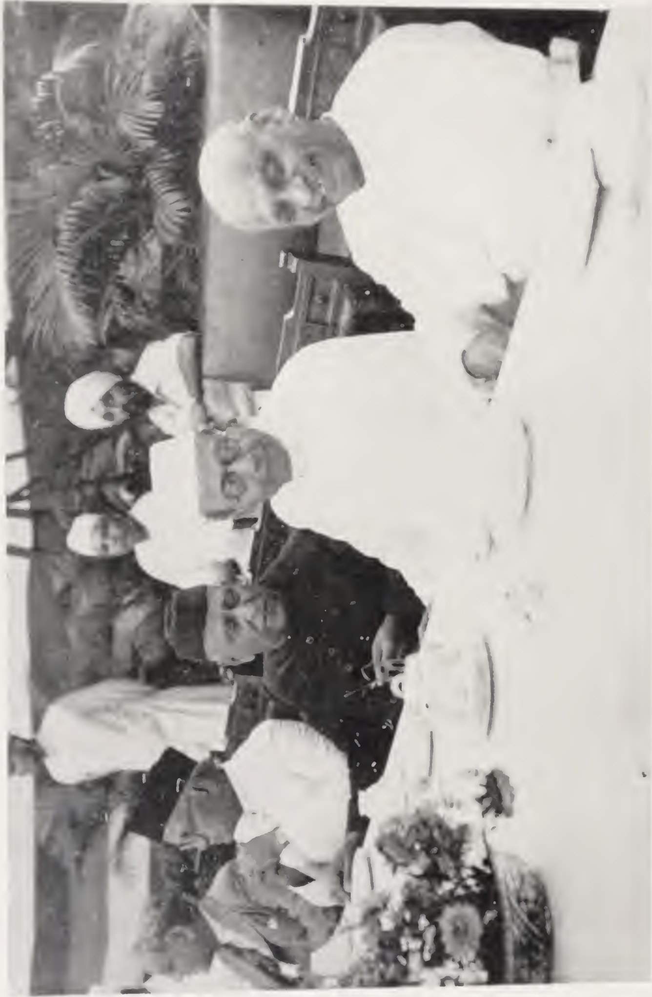
BOMBAY PREMIER B. G. KHER GAVE A RECEPTION TO THE ACTING PM, SARDAR PATEL, ON THE OCCASION OF HIS 74TH BIRTHDAY, ON 31 OCTOBER 1948, ON THE LAWN OF COUNCIL HALL, BOMBAY; TO THE SARDAR'S RIGHT ARE B. G. KHER, KUNWAR MAHARAJ SINGH, GOVERNOR, AND JIVRAJ MEHTA, FINANCE MINISTER