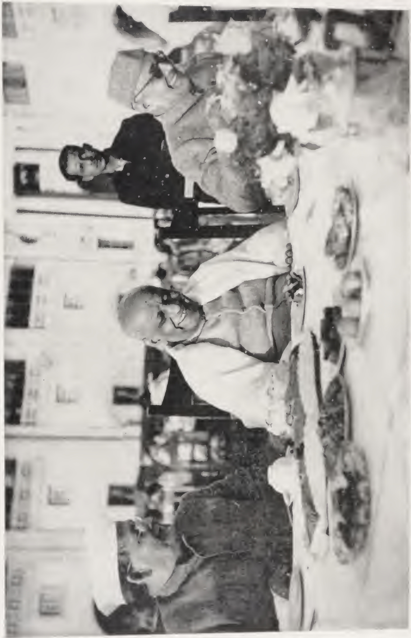
THE SARDAR SEEN IN A LIGHTER MOOD AT A RECEPTION IN HIS HONOUR BY THE PREMIER OF BIHAR,